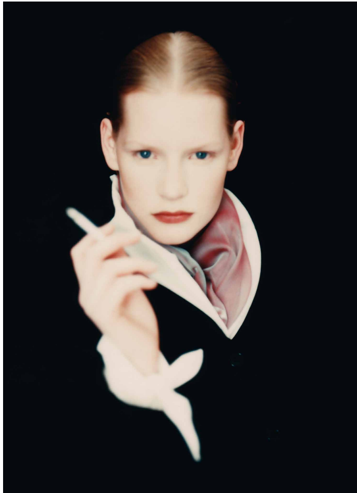
P 198 Romeo Gigli, 2008